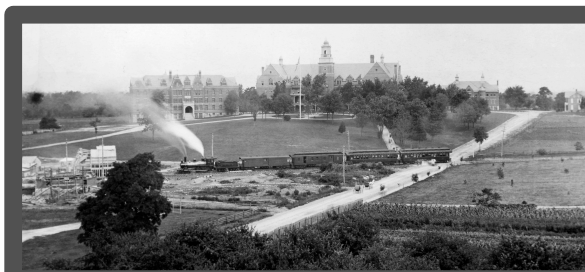
In the background (from left to right) is Horton Hall, Old Main, and Stewart Hall.

A Cumberland Valley Railroad passenger train steams past the Cumberland Valley State Normal School (now Shippensburg University) into downtown Shippensburg (1898).